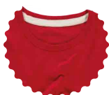
ROUND NECK IN RIB WITH RAW EDGE