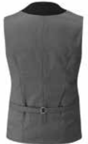
WOMENS SPENCER WAISTCOAT