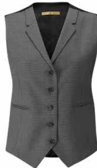
WOMENS LANGHAM WAISTCOAT

WAISTCOATS NEVER WENT OUT OF STYLE BUT RIGHT NOW THEY'RE REALLY HOT. OUR SELECTION OFFERS A CUT ABOVE THE REST WITH SUPERB STYLING & DETAILING & CAN BE MIXED & MATCHED WITH BLACK TROUSERS & SKIRTS OR BIRDSEYE DESIGN TO CREATE YOUR OWN, INDIVIDUAL LOOK.