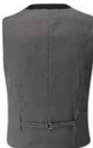
MENS BELTON WAISTCOAT