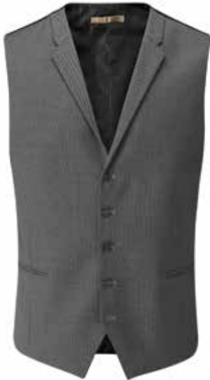
MENS CONNAUGHT WAISTCOAT