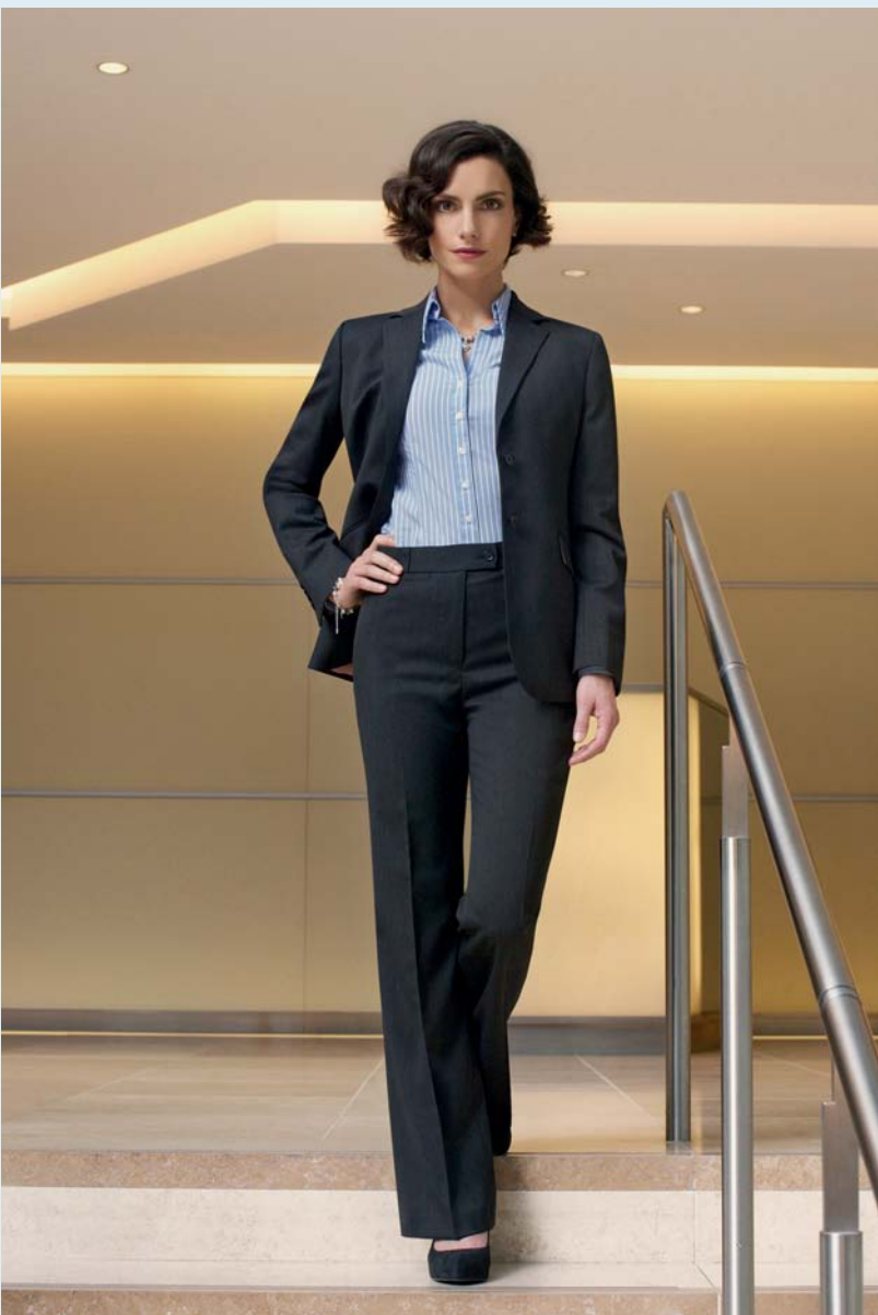
Grosvenor Trouser (Charcoal) Parallel leg trouser, single button front fastening, key card pocket, half lined, belt loops.