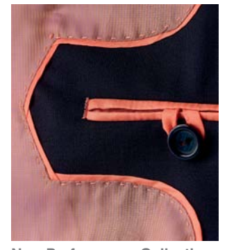
New Performance Collection ladieswear lining