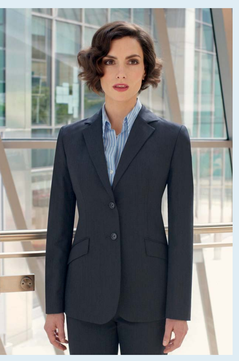
Connaught Jacket (Charcoal)