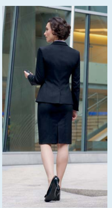
Wyndham Skirt (Black)