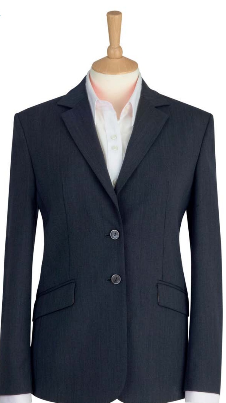
we search high and low for the best\ performing

Perano Blouse (Blue/White Stripe) Long sleeve, tailored fit princess seams.