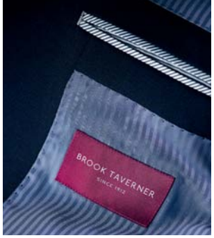
New Performance Collection menswear lining