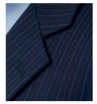
E. Navy Blue Pinstripe