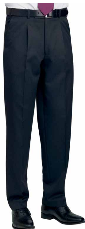
Delta Trouser (Charcoal) Single pleat, 2 side pockets, 1 rear pocket.

Machine washable. 65% Polyester, 35% Viscose.