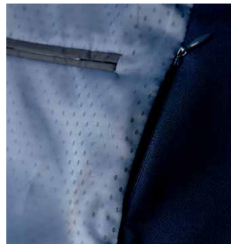
Sew Easy Embroidery System