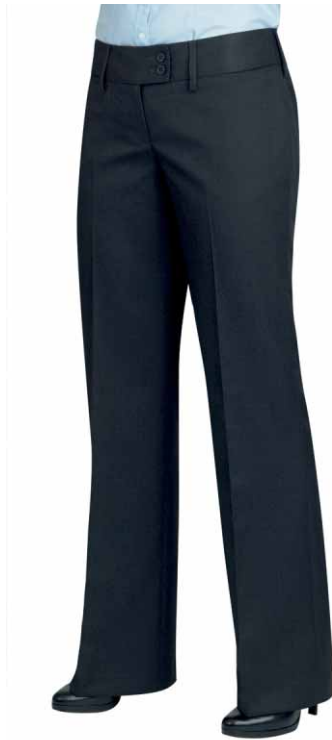
Theta Trousers (Charcoal) Low waist, flared leg, front double button fastening, key card pocket, mock rear pockets, belt loops.

tailored from an incredibly strong and durable fabric, offers market leading value for money.