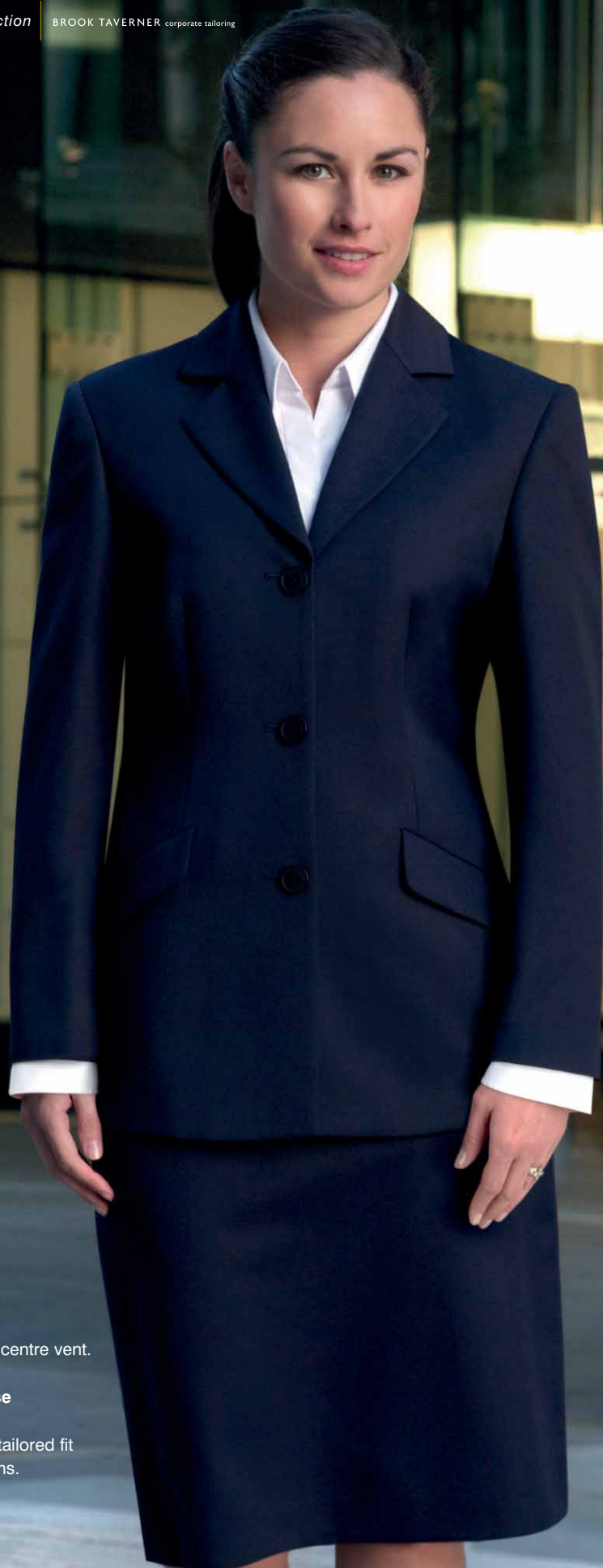
Zeta Jacket (Navy)