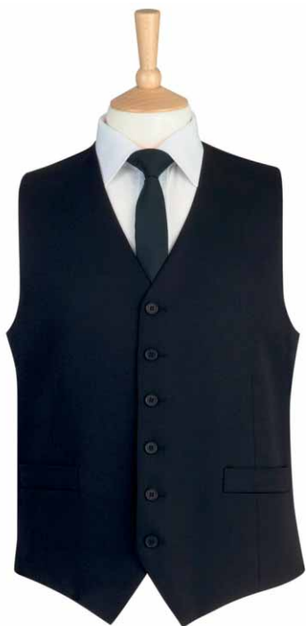
Gamma Waistcoat (Black) 6 button front, cloth backed, longer back with adjuster.

this fully machine washable collection offers unrivalled high-level performance