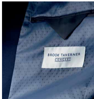
Concept Collection lining